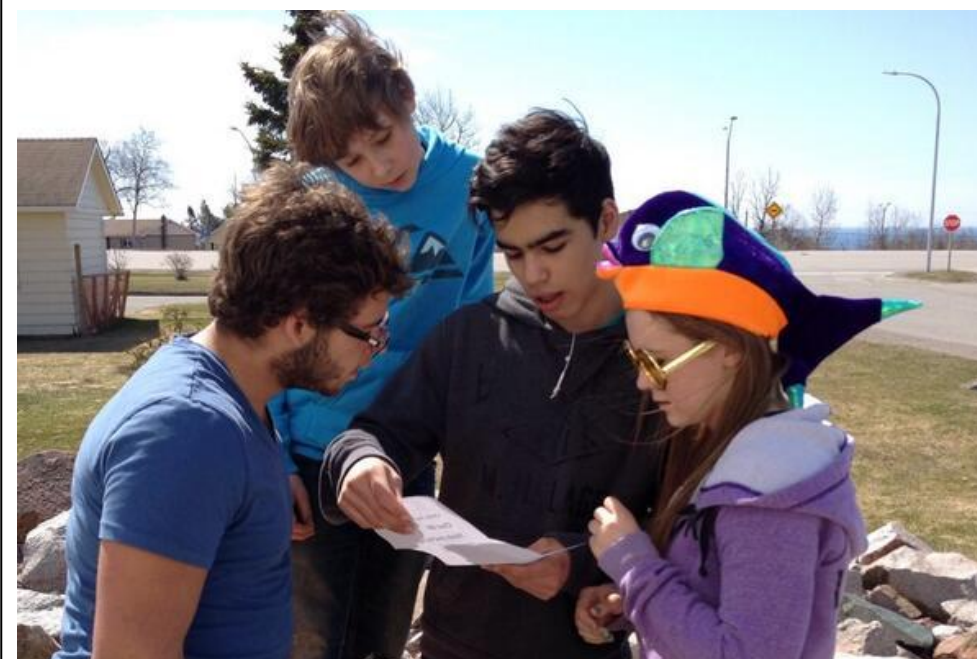
Above left: Students work together during the LSHS Amazing Race.