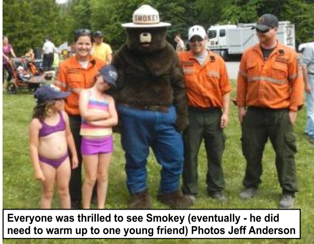
Everyone was thrilled to see Smokey (eventually - he did need to warm up to one young friend)