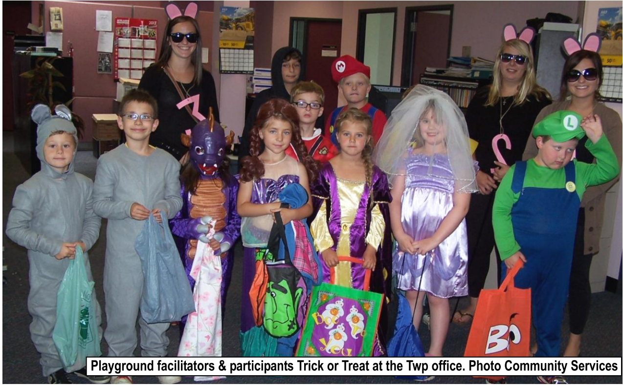
Playground facilitators & participants Trick or Treat at the Twp office.